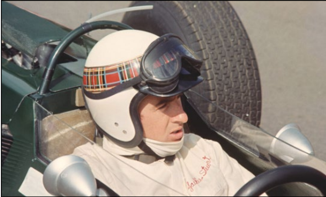
Sir Jackie Stewart wore a helmet painted with his clan's tartan colours.