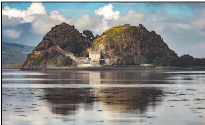
Dumbarton Castle overlooks the River Clyde.

attached to your country though is something you cannot describe, it's something you feel.