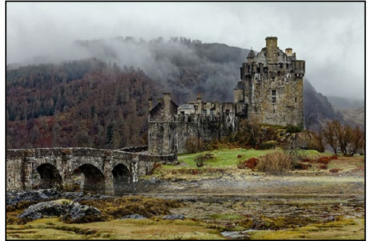
One of Scotland's most popular castles, Eilean Donan Castle was involved in the Jacobite Rebellion.

Scotland is a land of dark history, with some spooky and dark stories from times past. It's a place where mystical landscapes and abandoned castles have been left to ruin. The country is perfect for a dark history fan and lover of dark tourism in Scotland. If you want a glimpse into the country's sinister past, want to find haunted places in Scotland to visit, or enjoy dark travel and spooky places to visit in Scotland be sure to add these 15 dark and spooky Scottish sites to your itinerary.