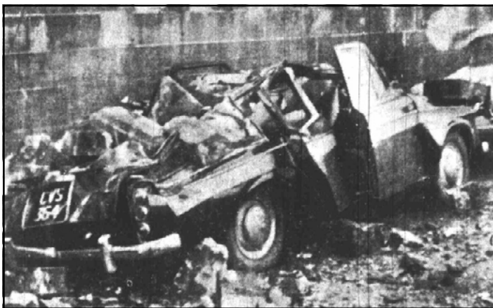
A car crushed by falling masonry in Glasgow.

The storm, named Hurricane Low Q, arrived during the night, when most people were at home in bed, blowing in house and shop windows, tearing roofs off buildings and trees from the ground. Cars were crushed by falling masonry and chimney stacks fell straight through tenements. It remains one of the greatest natural disasters in Scotland.