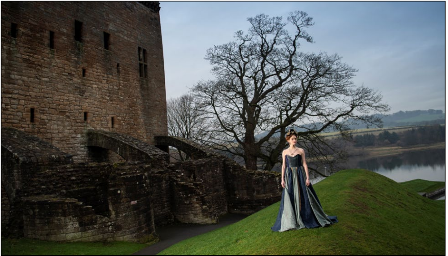
The Women of the Crown collection is coming to Edinburgh Castle.

Historic Environment Scotland is Scotland's leading public body charged, to care, protect and promote the country's proud past.