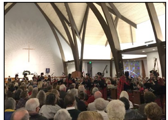
Stewart Tartan Pipes & Drums Christmas concert—Saratoga (Sunday, Dec 3rd).