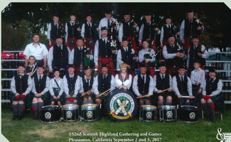
152nd Scottish Highland Gathering and Games Pleasanton, California September 2 and 3, 2017