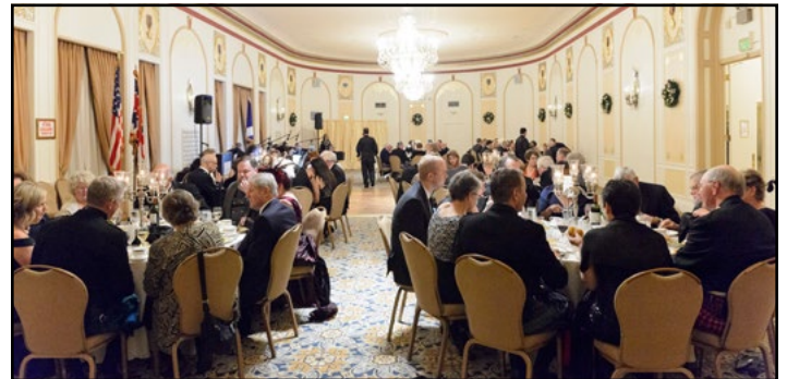
The Saint Andrew's Society of San Francisco Annual Banquet and Ball.