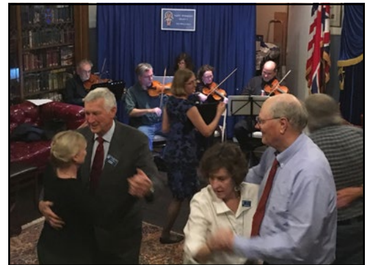
More Ceilidh dancing...