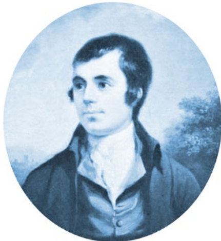
Robert Burns (1759–1796)

The St. Andrew's Society of San Francisco