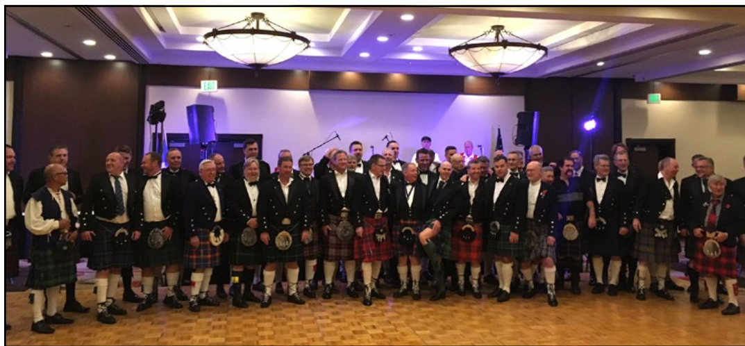
The lads line up at the St Andrew's Society of Oakland's Annual Ball.