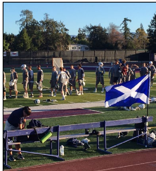
Scottish National lacrosse team in tournament play during Bay Area visit.