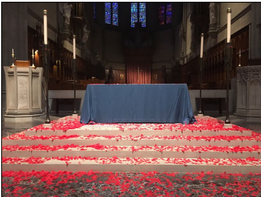
Grace Cathedral Service of Remembrance—poppies.