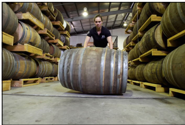
A worker rolls a cask of single malt whisky at the Sullivan's Cove whisky distillery in Hobart, Tasmania, Australia.