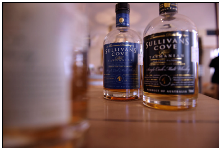
Sullivans Cove French Oak Cask, center, and American Oak Cask.

With 224,000 international visitors to the state in the 12 months to June, up 13 percent over the previous year, the pair see the distillery as a tourist drawcard as Tasmania seeks to capitalize on a surge of interest from Asia, especially China, after President Xi Jinping's visit to the island two years ago.