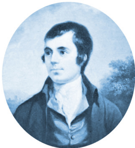
Robert Burns (1759–1796)

The St. Andrew's Society of San Francisco