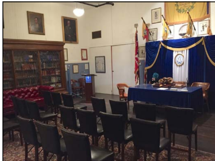
Firehouse upgrades: new seating and lighting

Charirman's Report, continued from page 1