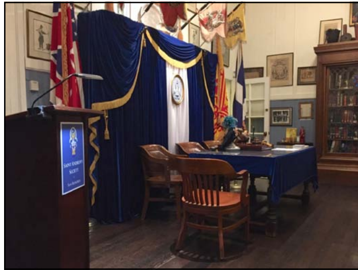
Firehouse upgrades: Speaker's podium and top table with new lighting