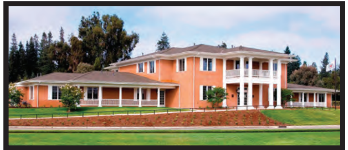
Fisher House, Palo Alto

As of that publication date the two newest Fisher Houses were a second house in Houston, TX supporting the Michael DeBakey VA Medical Center, and a house in Murfreesboro, TN, supporting the Tennessee Valley Healthcare