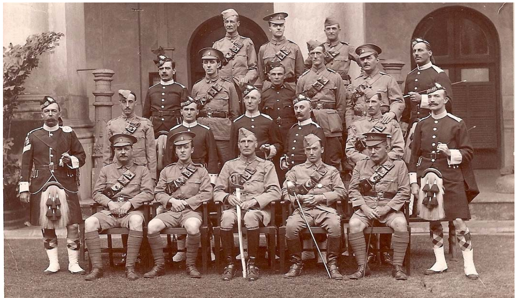
Photo above shows members of the Calcutta Scottish with members of the Calcutta Light Horse, circa 1916.

All corners of the globe have seen and heard, and in most cases benefited from their presence. Clan societies, pipe bands and even Scottish military units have been formed from Australia and South Africa, to Canada and even India. This month's Scottish military article is on a short lived, but rather interesting regiment in the Auxiliary Force, India: the Calcutta Scottish .