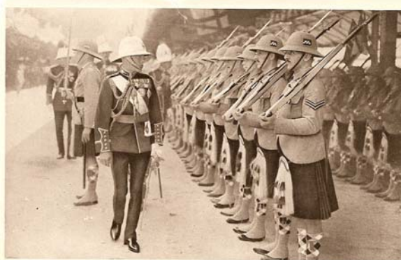
INSPECTING THE GUARD OF HONOUR OF CALCUTTA SCOTTISH AT HOWRAH STATION, CALCUTTA, 1922

In 1921 the Prince of Wales visited the Far East in HMS Renown and on a visit to the city on 24 December inspected the Calcutta Scottish (photo