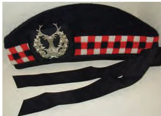
Photo on left is of diced Glengarry with the Regimental badge of the Gordon Highlanders. Soldier and drummers tend to wear this type of Glen. The Argyll and Sutherland Highlanders and its affiliates (i.e. the Calgary Highlanders of Canada) wear the red and white dicing. Police pipe bands sometimes wear black and white diced bands.

For a period in the 19th Century it was worn by all British soldiers (Welsh, English and Irish too). The Glen was all black and a regimental badge was attached.